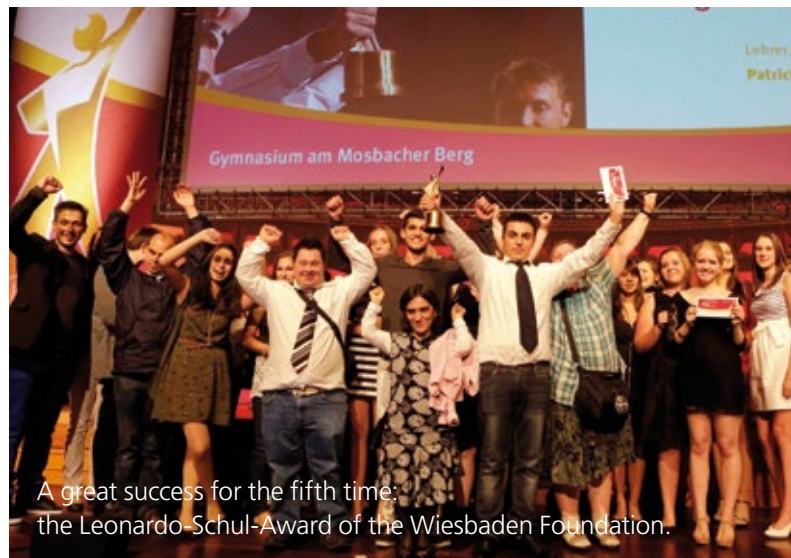
A great success for the fifth time: the Leonardo-Schul-Award of the Wiesbaden Foundation.