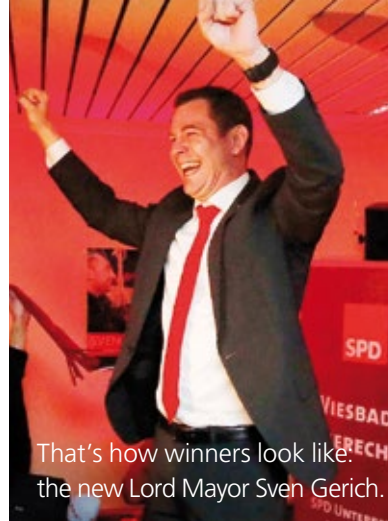
That's how winners look like: the new Lord Mayor Sven Gerich.