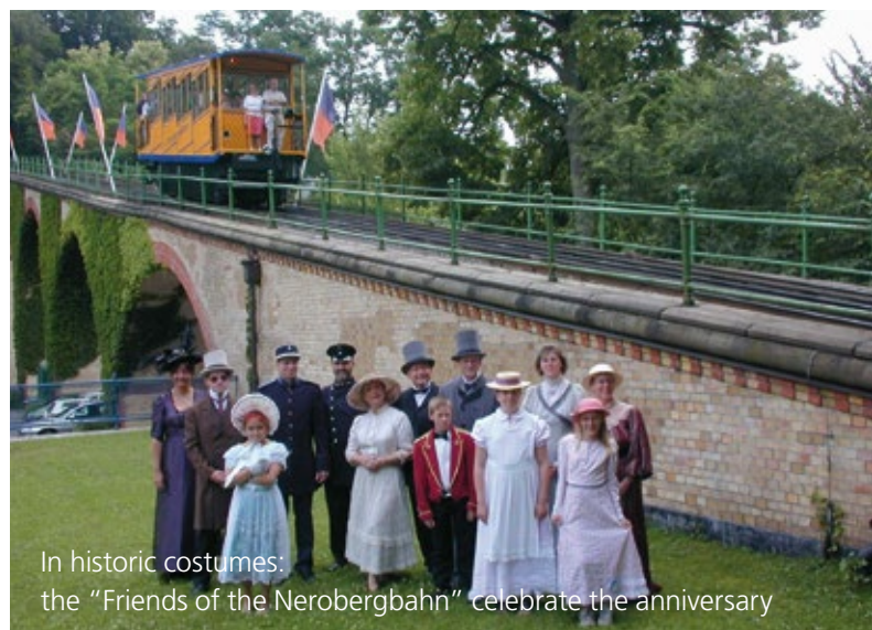
In historic costumes: the "Friends of the Nerobergbahn" celebrate the anniversary