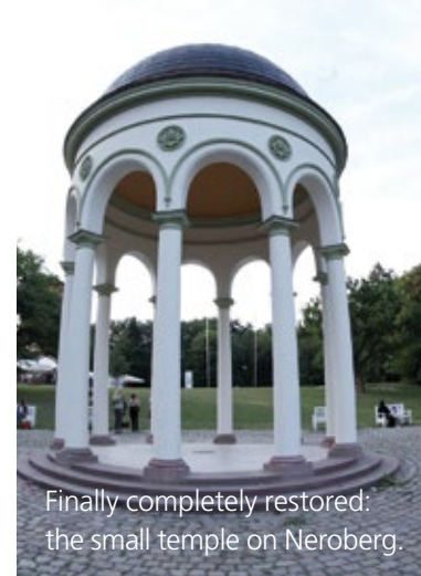
Finally completely restored: the small temple in Neroberg.