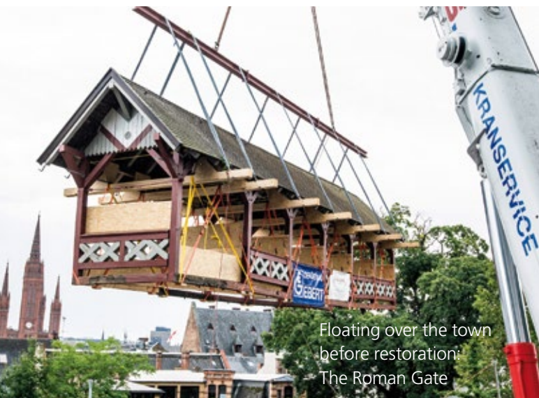
Floating over the town before restoration: The Roman Gate