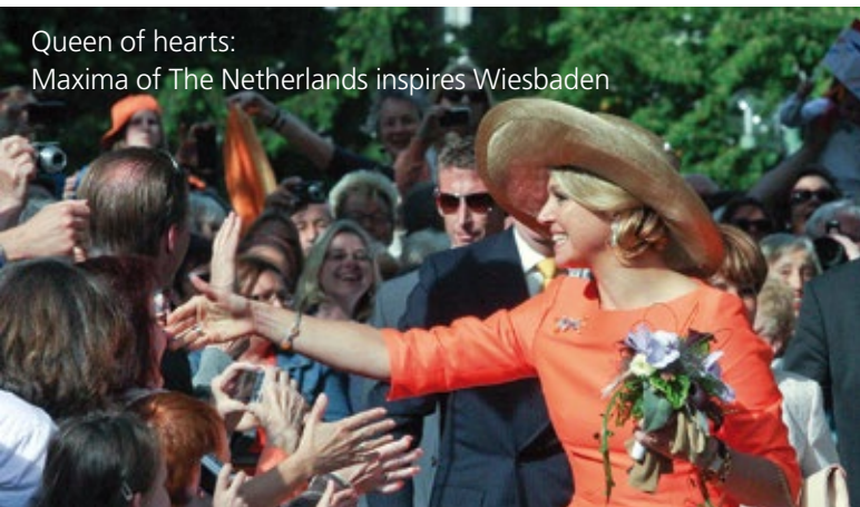
Queen of hearts: Maxima of The Netherlands inspires Wiesbaden