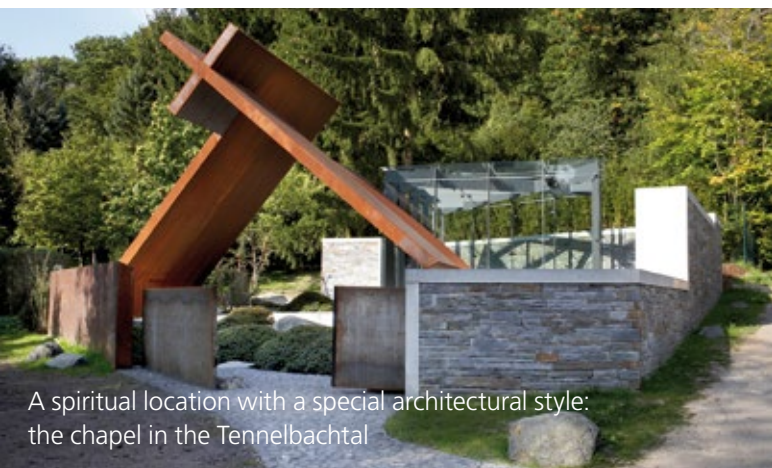
A spiritual location with a special architectural style: the chapel in the Tennelbachtal